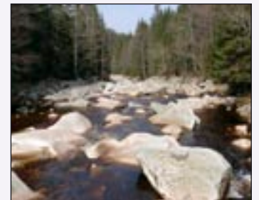
the Vydra river near Srní