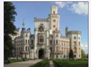
the Hluboká château