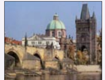
Prague - Charles Bridge