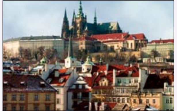
the Prague Castle

Participants are encouraged to take advantage of this opportunity to visit some of the beautiful historical sites in the Czech Republic, such as the city of Prague, Český Krumlov, the Hluboká château, etc. For more information, log on to the following websites information: http://praha-1.webz.cz/ , http://www.ckrumlov.cz/uk