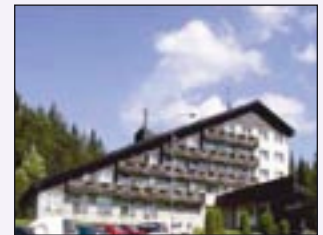
Hotel Šumava in Srní & Site for AMR Symposium