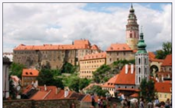
the castle of Český Krumlov