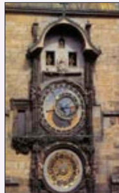
Prague - the astronomical clock of Old town hall