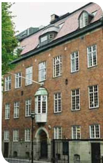
The Society's building at Klara Östra Kyrkogata 10 in Stockholm