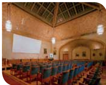
The conference Hall