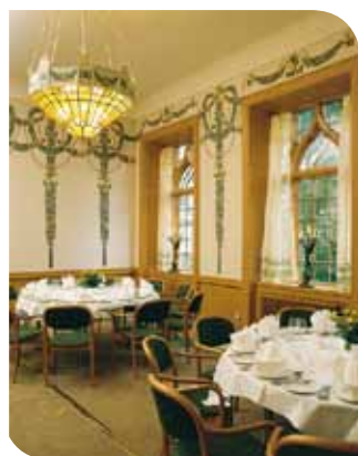
The on-site Restaurant