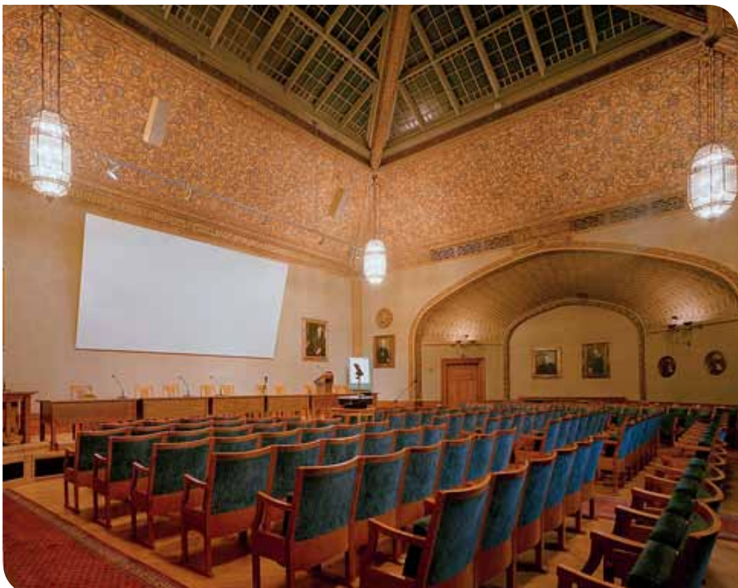
The conference Hall