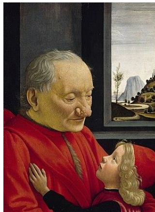
An Old man and his grandson by Domenico Ghirlandaio an Italian painter of XV century.

Franco Fedeli – It is more impressive the macroscopic aspect than the histological findings.